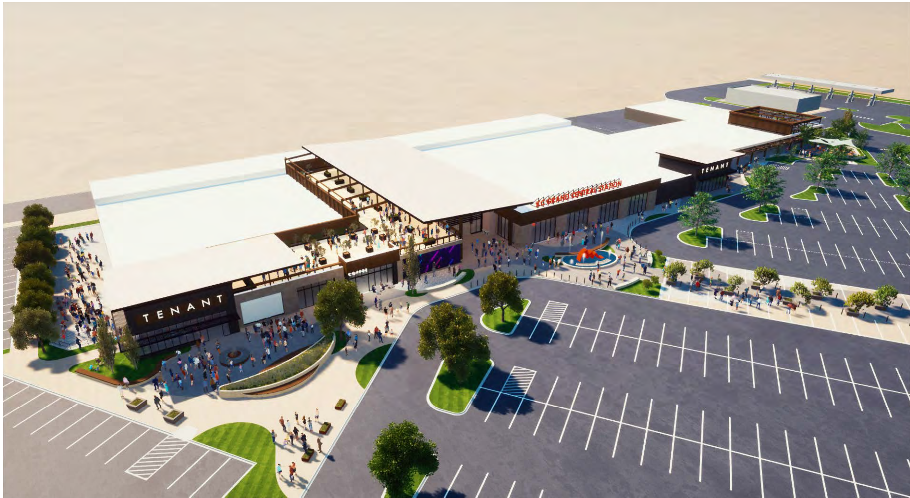
3D Model Imagery