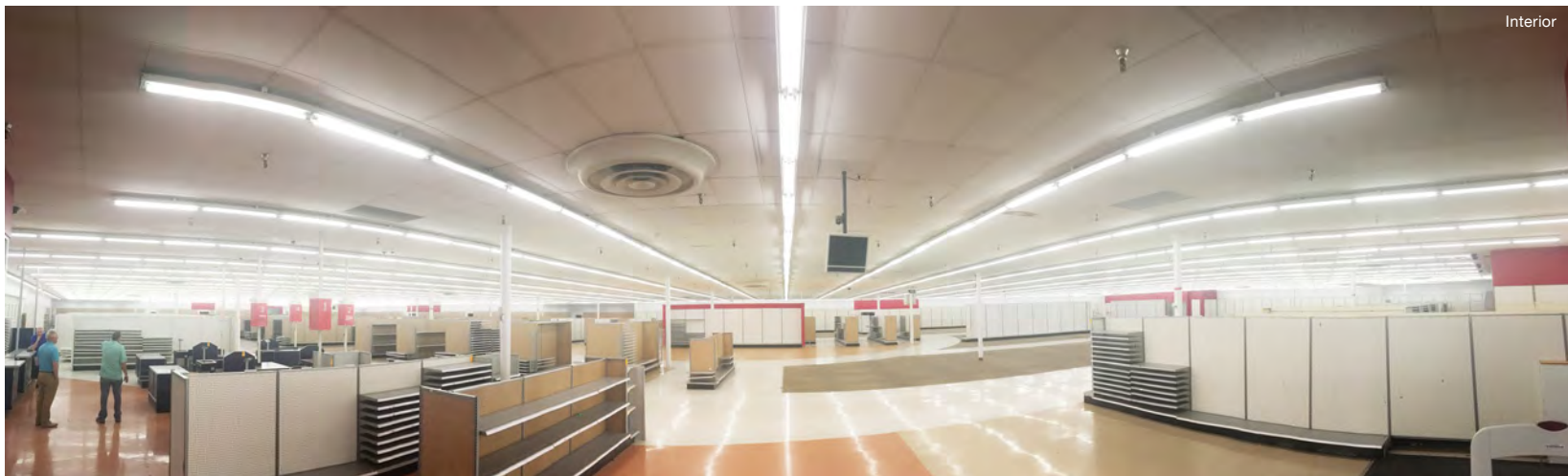
Small Shop Space also available for lease by Block & Company