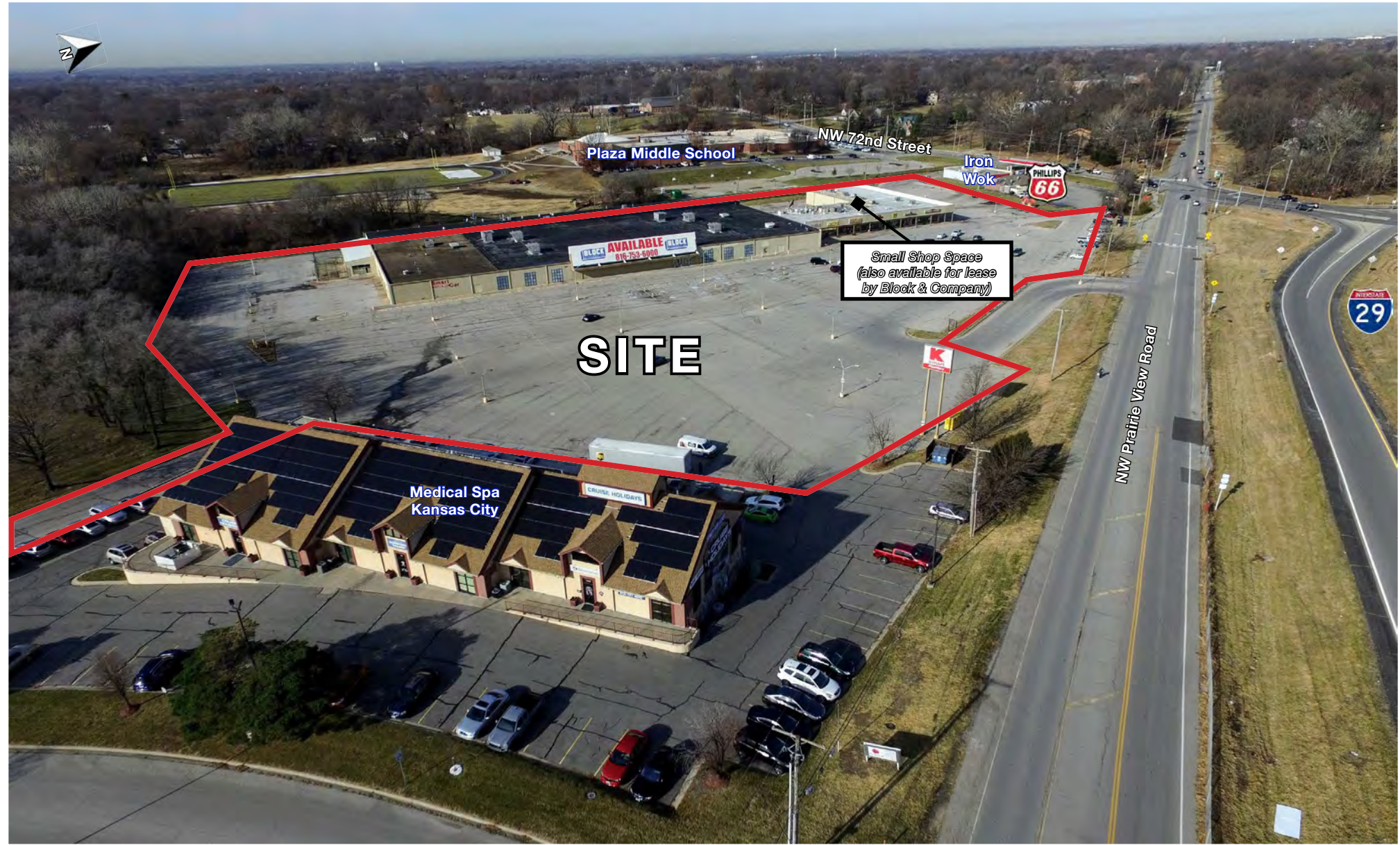
AERIAL DRONE PHOTO